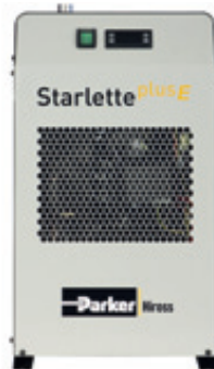
Equipped with digital controller