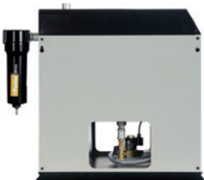
A pass-through drain niche allows easy drain access from both sides