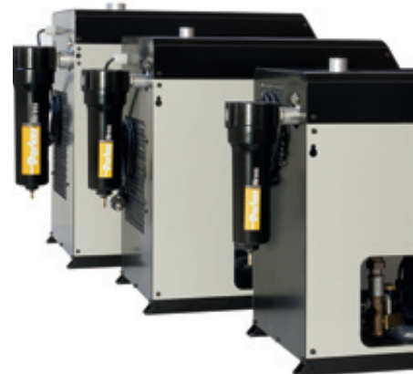
Optional pre-filter (not part of the standard scope of supply).