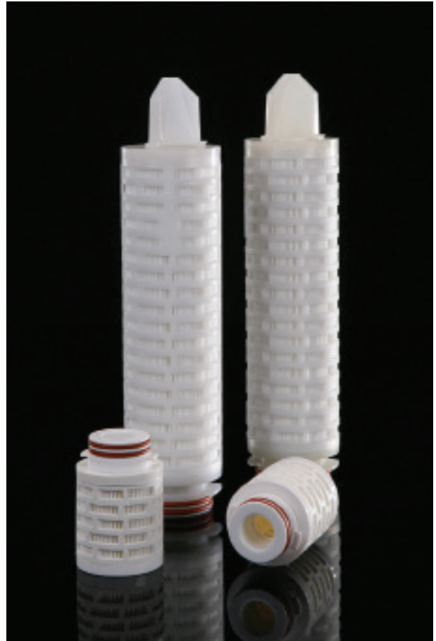
Note: TETPOR is a registered trademark of Parker Hannifin Corporation.