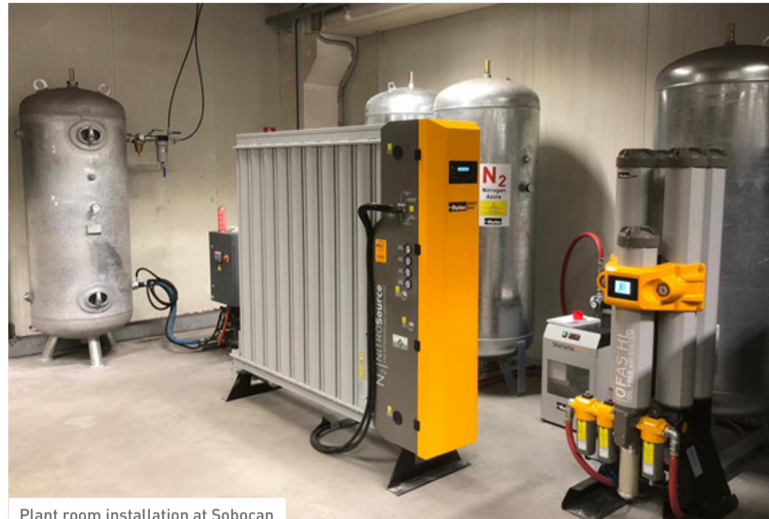
Plant room installation at Sobocan

The installation has strengthened Fering Fit’s position as regional experts in the field of technical gases and compressed air. Many prospective clients are seeing the success and savings realised by this project and are now considering generating their own high-pressure nitrogen from equipment to be supplied by Fering Fit.