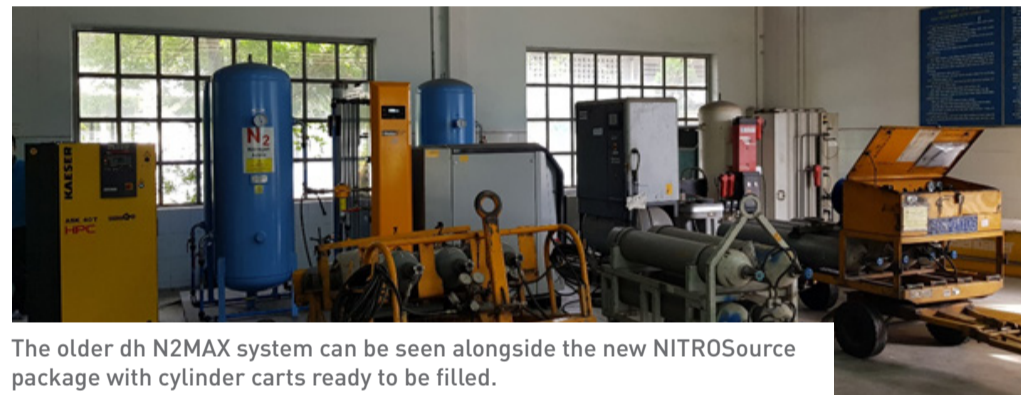
The older dh N2MAX system can be seen alongside the new NITROSource package with cylinder carts ready to be filled.