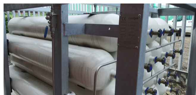
High pressure horizontal, manifolded, cylinder pallet. Permanently located on site with 490 m 3 storage capacity.