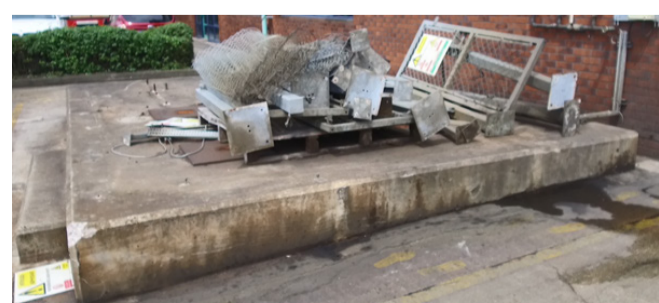
Empty concrete plinth with the remains of security fencing, where once a gas company liquid nitrogen bulk vessel and evaporators stood! This area was re-designated for extra office space at the front of the building.