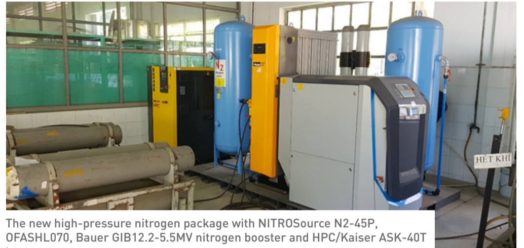
The new high-pressure nitrogen package with NITROSource N2-45P, OFASHL070, Bauer GIB12.2-5.5MV nitrogen booster and HPC/Kaiser ASK-40T low pressure screw compressor. Output 34.7m 3 /h @ 0.1% maximum remaining oxygen content up to 350bar(g).

Mico Mineral service and support personnel travelled to the UK for extensive maintenance training at MSS, Parker GSFE, Kaiser and Bauer. This enables Mico Mineral to honour all the warranty conditions of the individual suppliers, whilst providing first class support locally to Vietnam Airlines.