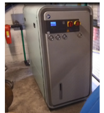
Sauer “Tornado” packaged, silenced, 350 bar(g) nitrogen booster compressor.