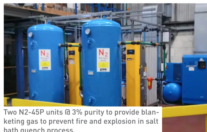
Two N2-45P units @ 3% purity to provide blanketing gas to prevent fire and explosion in salt bath quench process.

In addition, the removal of the existing bulk liquid vessel, and associated plinth, freed up valuable real estate on-site that was used for much needed extra office space.