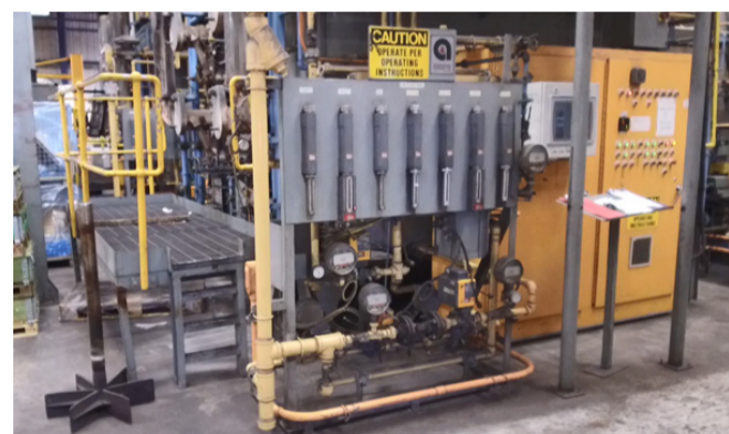
Austempering batch furnace.