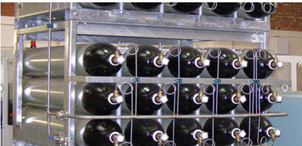
High pressure cylinder storage banks filled from a Parker NS-PSA. No boil-off losses as happens with liquid vessels

Using high pressure cylinders as an alternative to liquid nitrogen back-up means, that unless there are leaks in the system, the stored volume is not wasted through boiling off to atmosphere and can remain charged up almost indefinitely, ready to use instantly as required. Topping the cylinders up with nitrogen from a Parker nitrogen generator can cost as little as €10 for a complete refill, compared to a typical MCP cost of over €100.