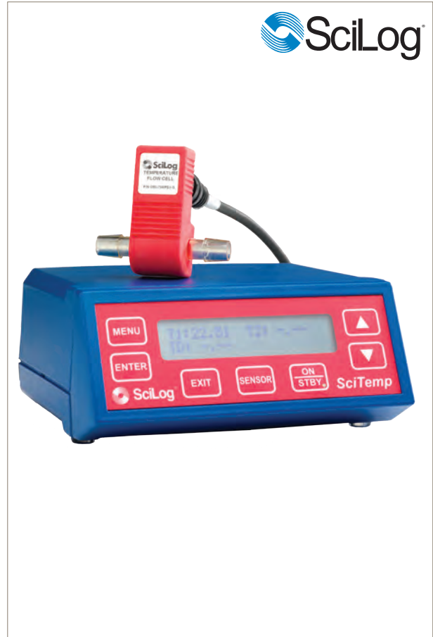
Note: SciTemp® is a registered trademark of Parker Hannifin Corporation.