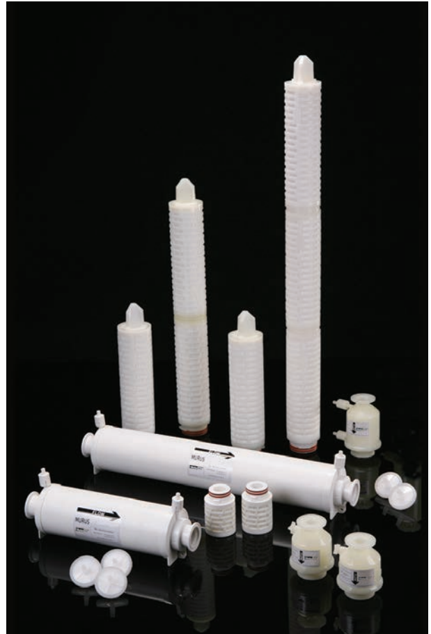
Note: TETPOR is a registered trademark of Parker Hannifin Corporation.