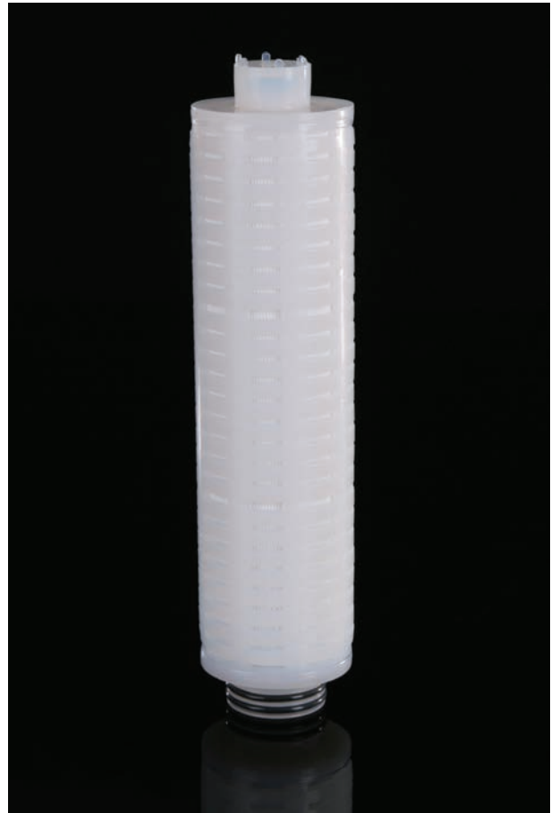
Note: TETPOR is a registered trademark of Parker Hannifin Corporation.