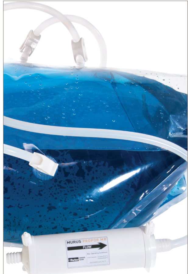
Note: DuraPure™ is a trademark of Parker Hannifin Corporation.