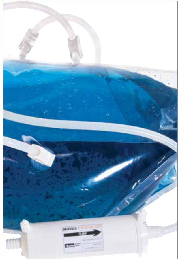
Note: DuraPure™ is a trademark of Parker Hannifin Corporation.