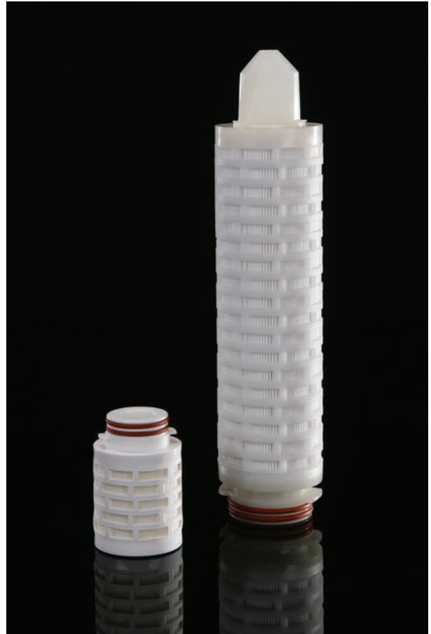
Note: BIO-X is a registered trademark of Parker Hannifin Corporation.