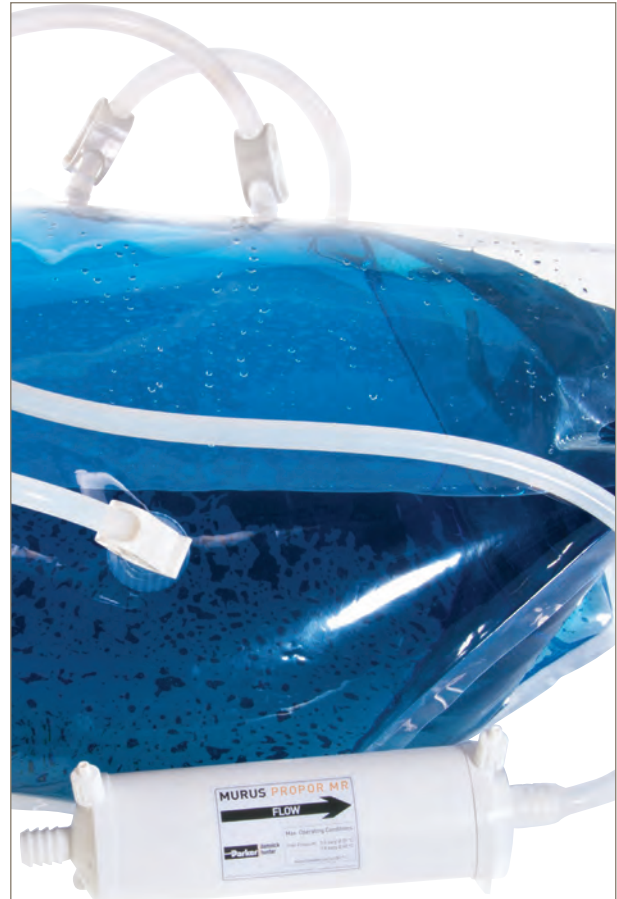
Note: DuraPure™ is a trademark of Parker Hannifin Corporation.