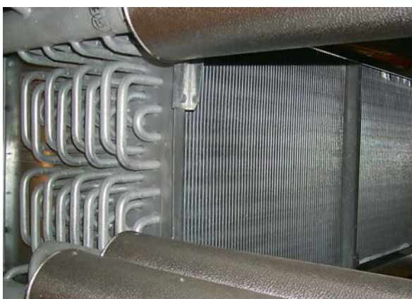
Evaporator with surface temperature -32°C completely dry & without any ice.