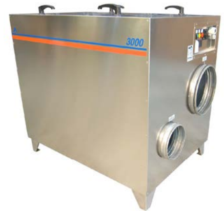
DT-3600 inside freezer version