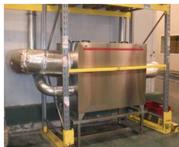
Installation outside freezer room