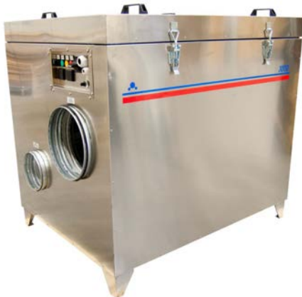
DT-3600 outside freezer version

The outside version can also be fitted with an air-to-air heat exchanger which is mounted on the dehumidifier casing. The heat exchanger will drastically reduce the energy consumption of the unit and since it will pre-heat the reactivation air, the life time of the reactivation filter will be increased.